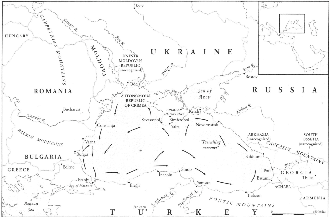
Map 1. The Black Sea Today